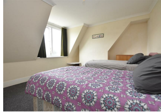
Bedroom 13'8" x 12'0" (4.19m x 3.68m)